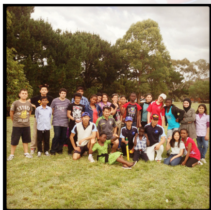
Students with the Chinese Cricketing group