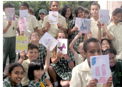
Narwee students proudly display their new books

After that, I asked her some questions that were written down on the pink paper. I don't remember many of the answers but I remember two important things. She told me she liked to connect with people like on this Friday. She was very active. She walked about an hour every day. She sometimes went to the swimming pool to swim. I thought if I was 70 years old I couldn't do like her. She told me another important thing that I really wanted to know from them before they came to our school. She told me about what advice did she have for teenagers. She was crying while she talked about it because