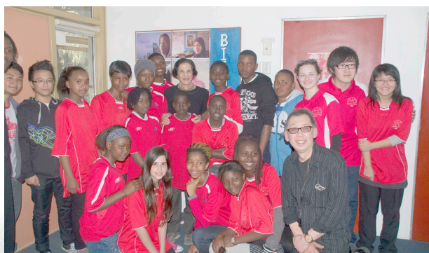
Governor Maree Bashir with Suhandi and some of the performance group

Beverly Hills Intensive English Centre is a special NSW Government High School that assists newly arrived young refugee and migrant people for 6-12 months to develop English language skills before transitioning to about 20 local area mainstream high schools.