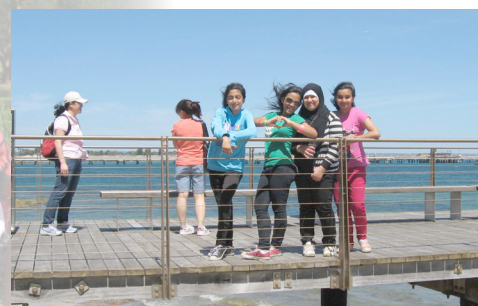
Students from ms Zhang's class