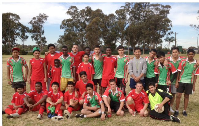
Students from Lurnea IEC and BHIEC soccer teams