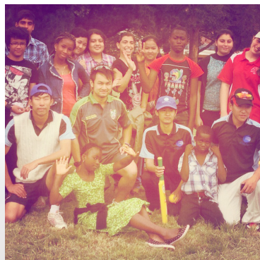
Sugden and Funnell's Classes