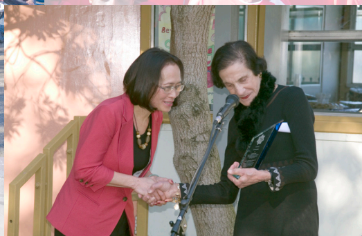
Yen and the Governor