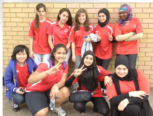
The BHIEC volleyball team

Beverly Hills Intensive English Centre Melvin St North Beverly Hills NSW 2209 Australia ENQUIRIES Phone 9533 1293 Fax 9584 1963 beverlyhg-i.school@det.nsw.edu.au