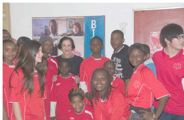
BHIEC Performance Group

In the Sydney Morning Herald (the Sydney Magazine December 2012) Yen was included in the top 100 Sydney's Most influential people 2012.