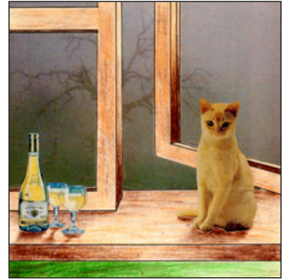
Photo-Montage Creating an image using cut-out photographs